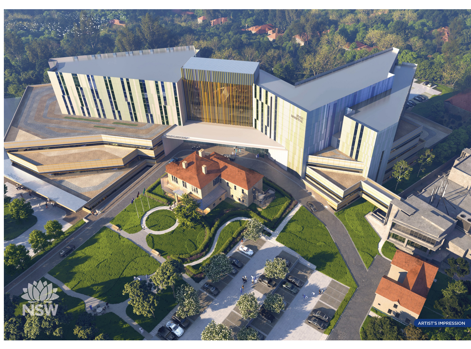
The latest designs of the Ryde Hospital Redevelopment showing the aerial view of the hospital.

Central to the design is connections with existing onsite heritage buildings such as Denistone House and The Stables, and the nearby Blue Gum High Forest, as well as the inclusion of green spaces to create a welcoming environment for staff, patients and visitors.