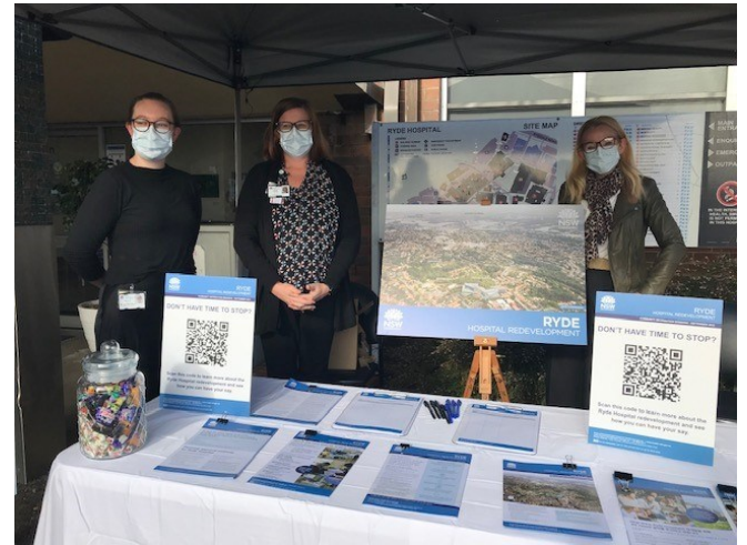
Members of the redevelopment team at a Ryde Hospital pop-up stand.

A series of pop-up sessions at Ryde Hospital and several local shopping centres provided an opportunity for the team to talk to staff and the community about the latest designs and what they would like to see as part of the redevelopment. The eight sessions in September 2022 were visited by approximately 120 community and staff members and showed the high level of interest in the redevelopment. The sessions also allowed the team to answer questions from staff and community members.