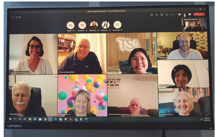
Members of the newly formed Consumer Reference Group attended the first meeting via videoconference in mid February