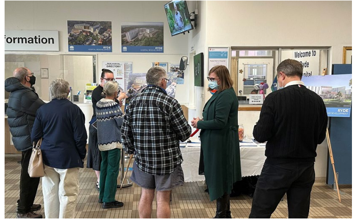
Information session in the main hospital entrance in July 2023

For an interpreter, call 131 450 and ask them to call 02 9978 5402