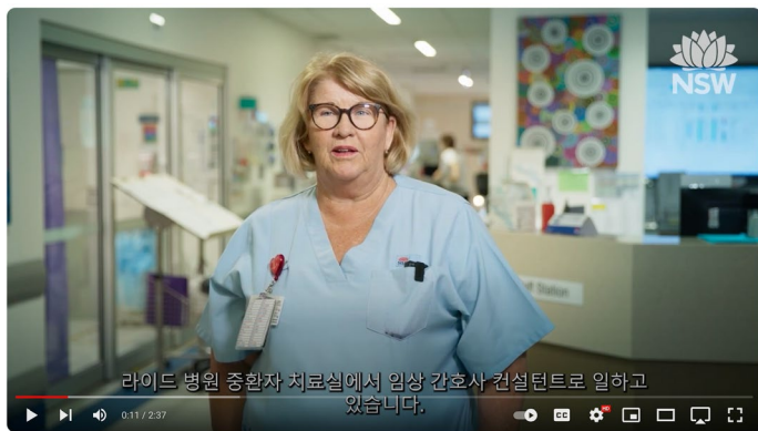
Korean subtitled video of Ryde Hospital Redevelopment – through the eyes of a staff member

Did you know that more than 50 per cent of the Ryde population speak a language other than English at home? This year we have continued to translate some of our project information into commonly spoken languages to create greater awareness about the redevelopment. We have translated project fact sheets and a video into Chinese (simplified) and Korean and while we're unable to translate material into all languages, we encourage communities to use the NSW Government translation service for their translation needs, details are provided below. This service is free and available 24 hours a day, every day.