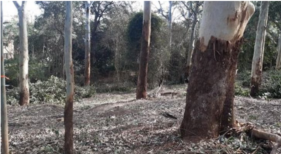
Clearing invasive weeds from the Blue Gum High Forest

Following project completion, the Northern Sydney Local Health District will manage and care for the forest and APZ.