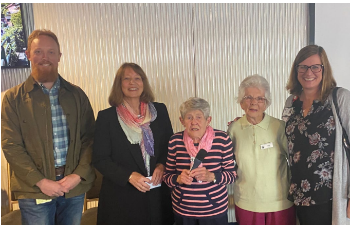
Ryde Hospital Redevelopment team with members of the Eastwood Probus Group in August 2023