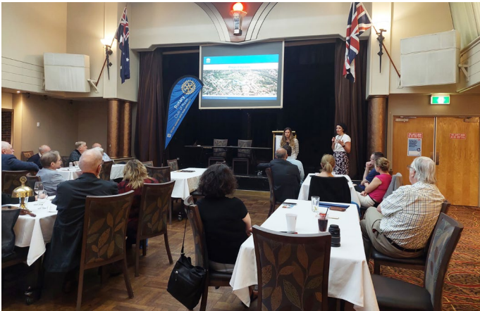
Ryde Redevelopment team presenting to the Rotary Club of Ryde in March 2023