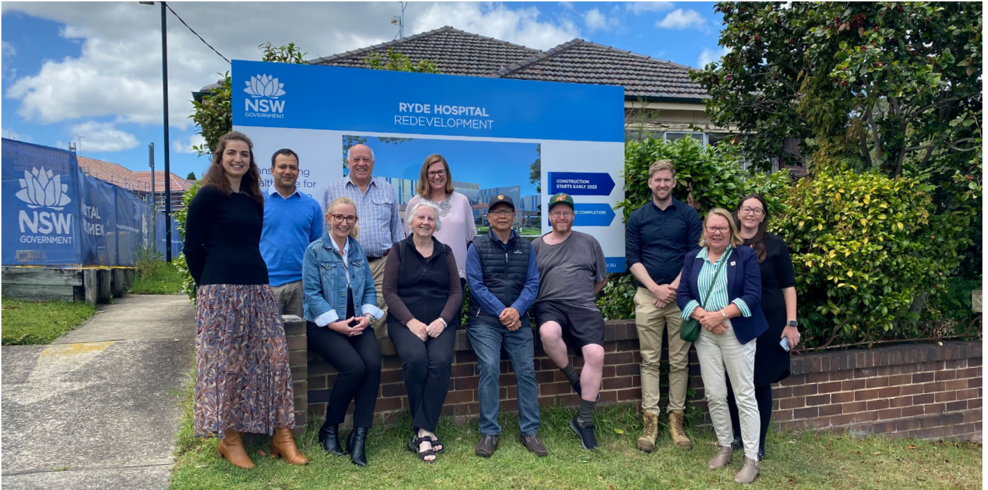
Redevelopment team and members of the Consumer Reference Group on a site tour of Ryde Hospital in October 2023

We thank our wonderful volunteers, Ryde Hospital staff and community participants for their enthusiasm and graciously giving their time this year. In particular, we would like to thank our Consumer Reference Group who meet monthly and provide a regular voice for the community.