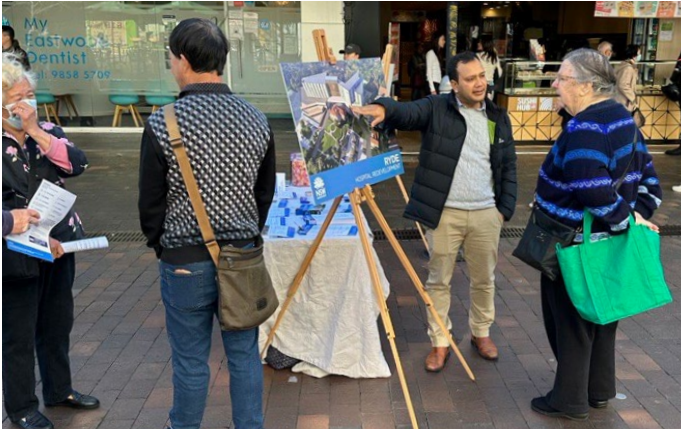
Information Session in Eastwood in July 2023