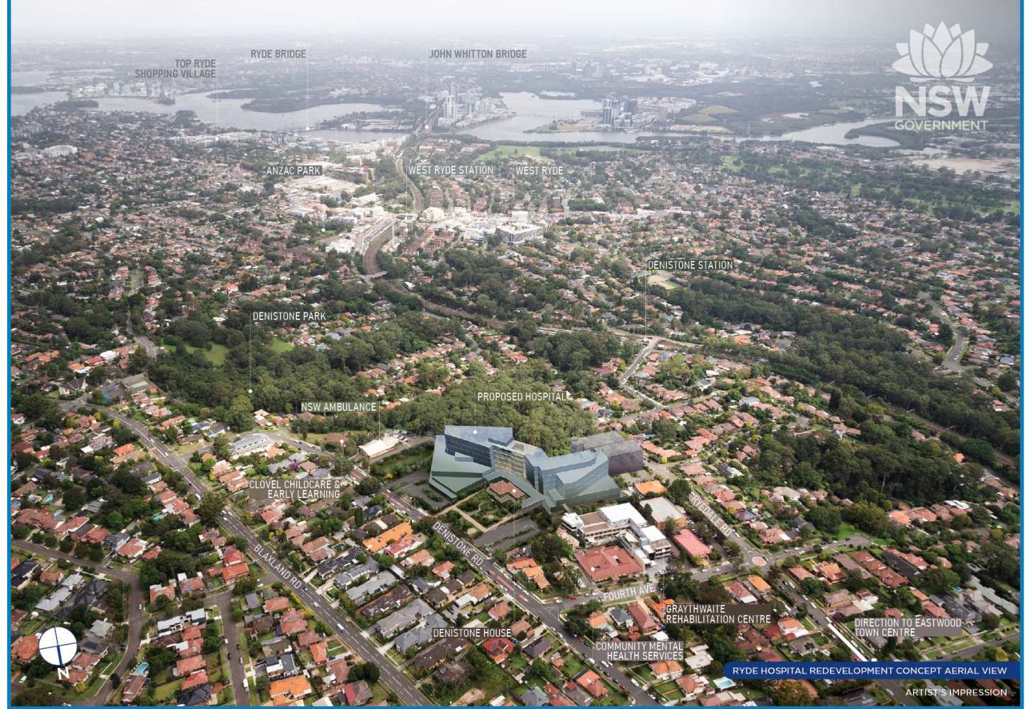
An aerial concept design of the Ryde Hospital redevelopment showing the location of the proposed hospital building and car park within the surrounding community.