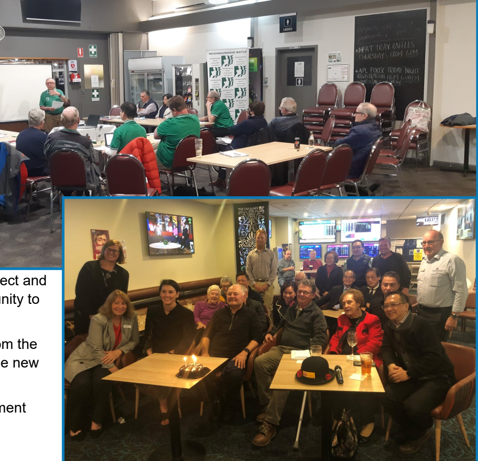
Above: members of the Ryde Hospital redevelopment team provided a briefing to the Eastwood Chamber of Commerce, followed by a Q&A session. Photo 9 May 2022.

If you would like to contact the redevelopment team please send us an email at rydehospitalredev@health.nsw.gov.au.