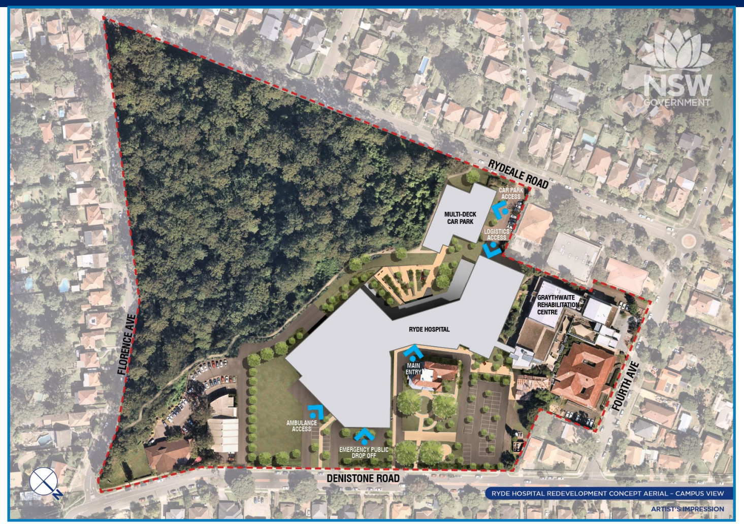
The masterplan for the Ryde Hospital redevelopment showing the location of the proposed building and it's connections with the Blue Gum High Forest, existing buildings (including Denistone House) and green space to be incorporated.